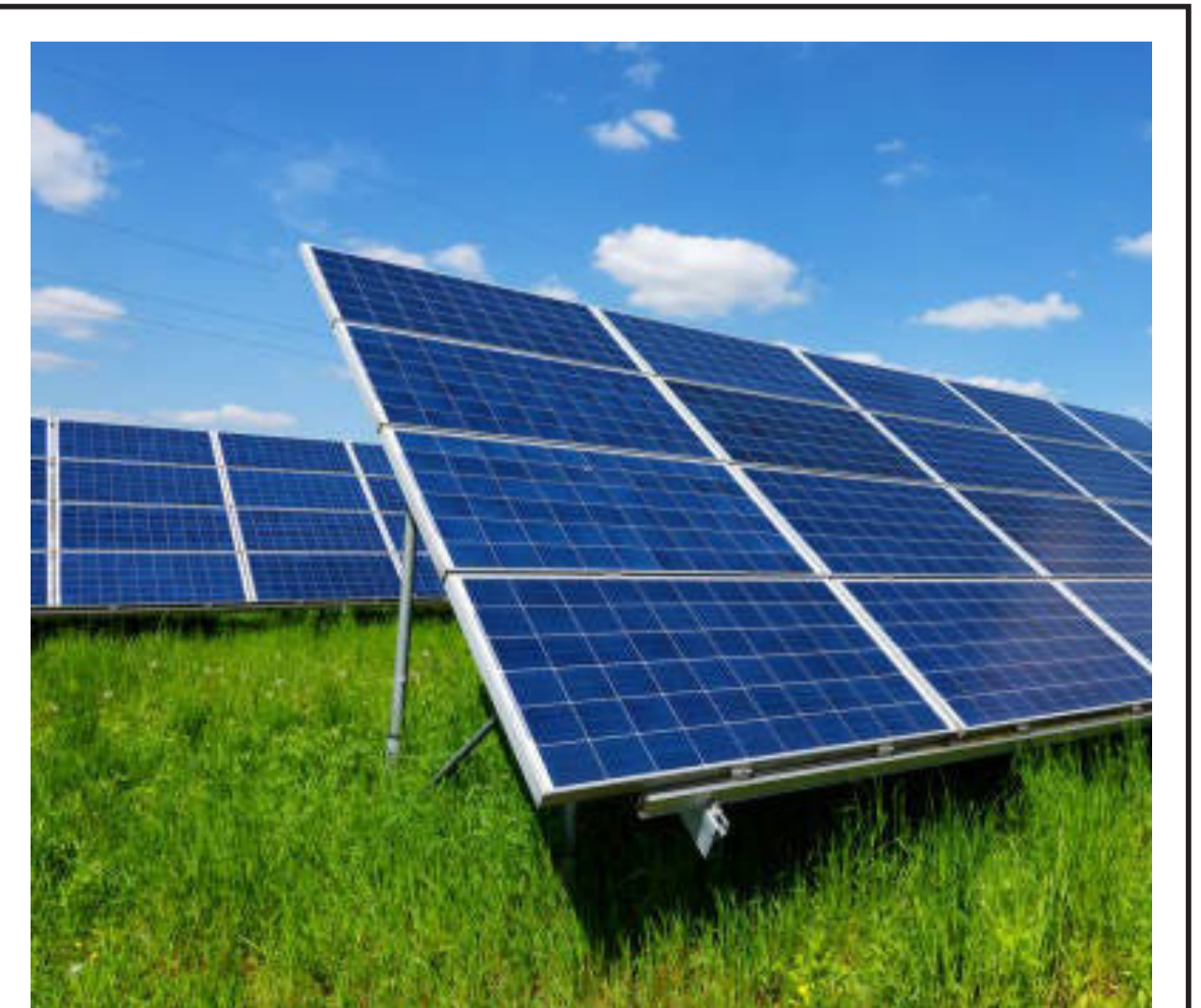
Example image showing similar photovoltaic panels and mounting system