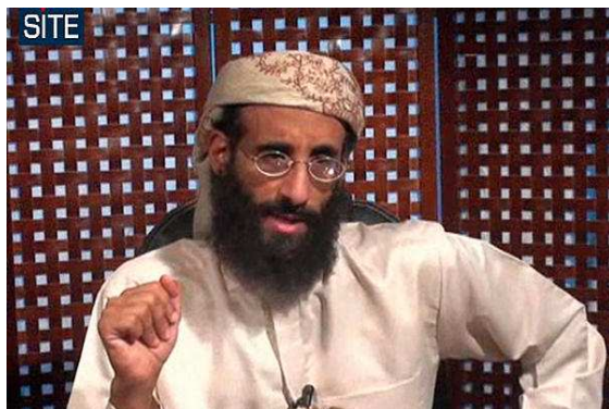
Yemeni-American cleric Anwar al-Awlaki

Anwar al-Awlaki, the charismatic Yemeni-American cleric and chief propagandist for al Qaeda Yemen, commented on the uprisings in the Arab world, saying that Islamist extremists had gleefully watched the success of protest movements against governments they had long despised: "The mujahedeen around the world are going through a moment of elation," Awlaki wrote in a new issue of the English-language Qaeda magazine Inspire, "and I wonder whether the West is aware of the upsurge of mujahedeen activity in Egypt, Tunisia, Libya, Yemen, Arabia, Algeria and Morocco?"