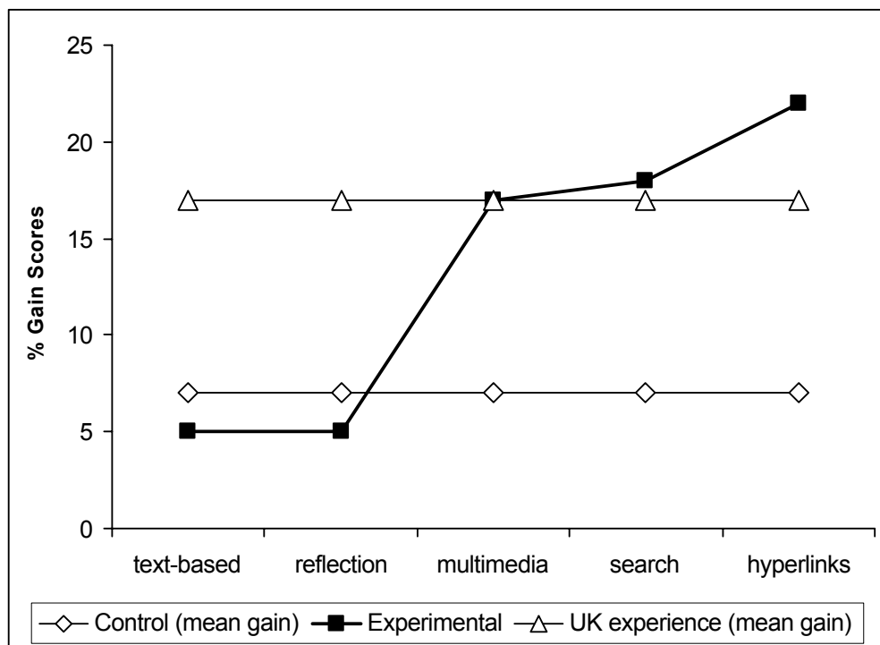
Figure 1. Mean gain scores on test items associated with different pedagogic strategies (information; reflection; multimedia; hyperlinks; search) for the experimental group (E1), compared with mean gain scores for control (C1) and UK experience (UKE) groups.

The E1 group was found to be midway between the EUL and CMC writers, having statistically significant differences in three of the five rhetorical measures (number of discourse markers, number of paragraphs, use of metaphors) when compared with both EUL and CMC writers; they remained indistinguishable from the Chinese writers in terms of their thesis statement, but had become indistinguishable from the UK writers in their lack of topic changes within paragraphs.