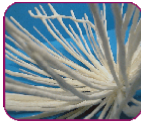
RP of dandelion seed

The Eden Project's new education centre "The Core" is due to be officially opened in the spring of 2006 but it has recently been opened to the public through a soft launch so that visitors can see the building evolve and grow over time, alongside the plants displayed there. The very centre of the building holds a central 'trunk' inside which one of the largest rock sculptures in the world will be housed. The display cabinets surrounding the trunk will house a set of exhibits illustrating classic examples of Biomimicry and will describe how for many years, we have turned to nature for inspiration in design and engineering. The scaled up RP models of a burdock seed, a dandelion seed and a piece of honeycomb will represent the inspiration behind Velcro®, parachutes and engineering structural elements including the hexagonal design of the Eden Project's own Biomes. A scaled up model of the head of a Gazania (a daisy-like flower) beautifully illustrates the Fibonnacci series, a mathematical sequence commonly found in natural structures and around which the roof of The Core is designed. The models are exact copies of real specimens collected locally and the original objects will be displayed alongside the RP models with magnifying glasses to illustrate how small the objects are in their true existence.